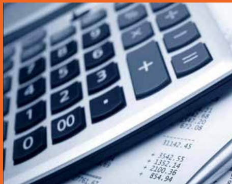
COST & ESTIMATES